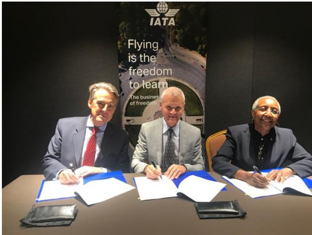
Mr. Alexandre de Juniac, Director General IATA