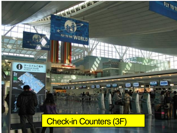
Check-in Counters (3F)