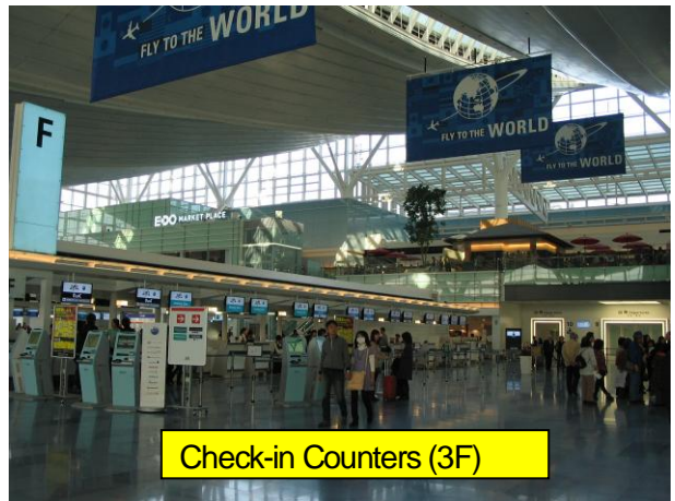
Check-in Counters (3F)