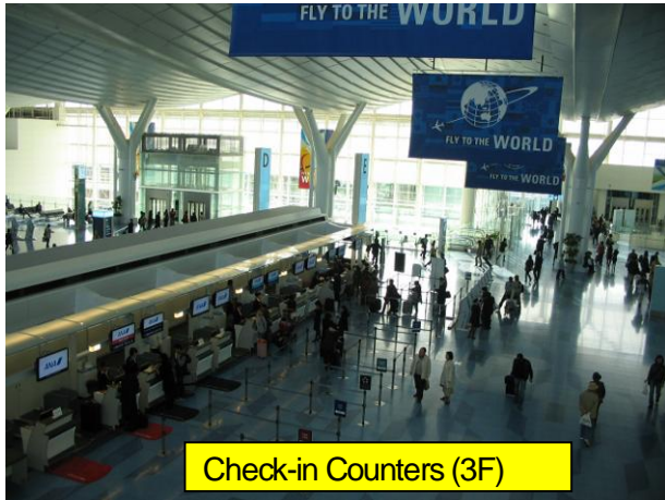
Check-in Counters (3F)