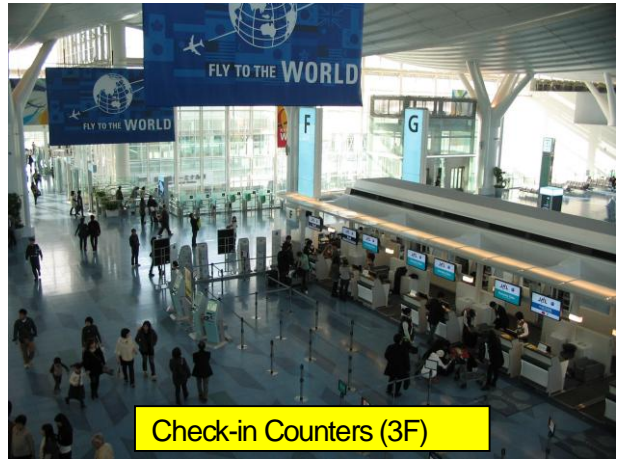
Check-in Counters (3F)