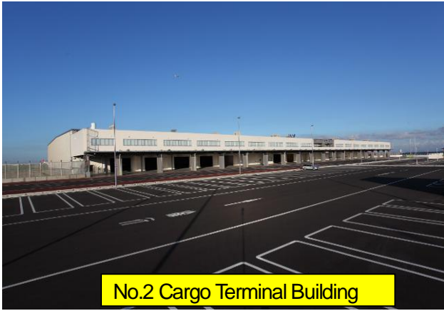
No.2 Cargo Terminal Building