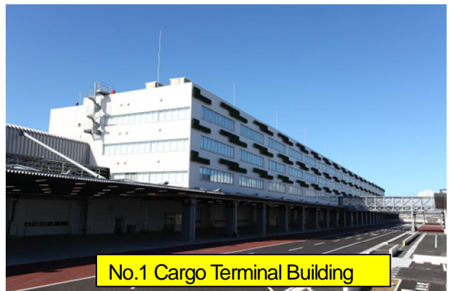
No.1 Cargo Terminal Building