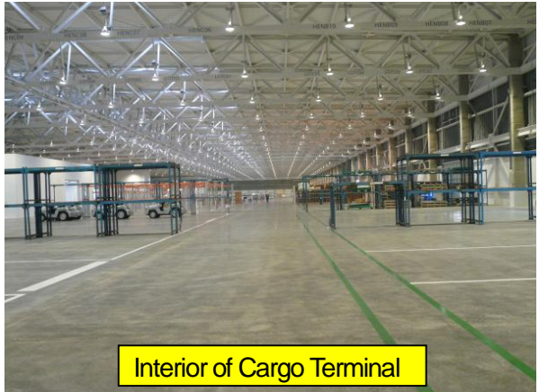
Interior of Cargo Terminal